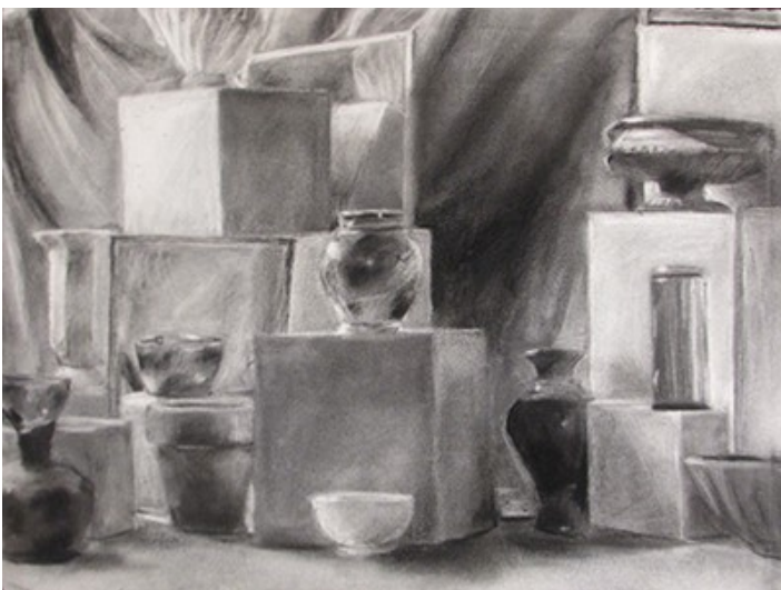
Still Life No. 8