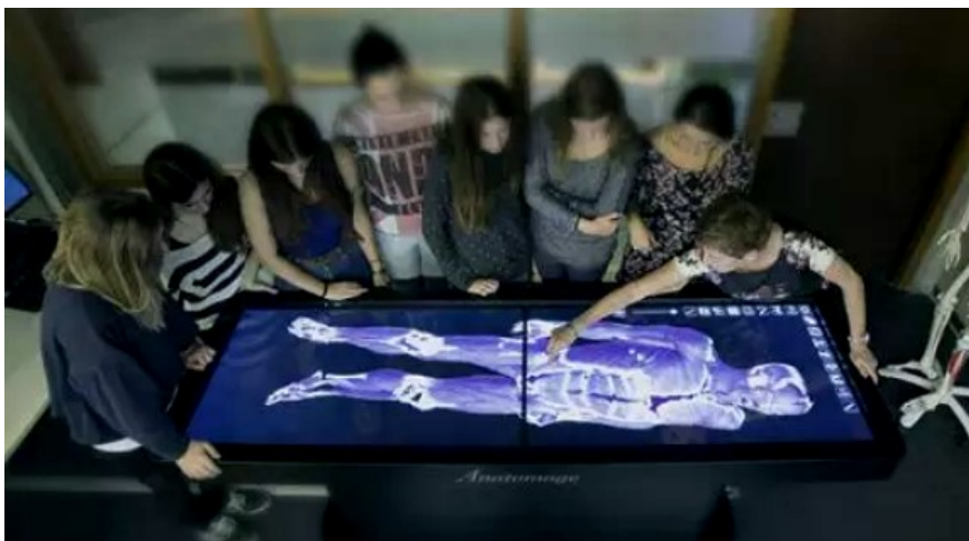
An Anatomage 3D Medical Imaging Table Convertible in use