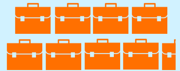
Each figure represents approximately 1,000 students