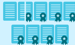
Each figure represents approximately 1,000 students

9,004 students took a license or certification exam 7,410 students passed