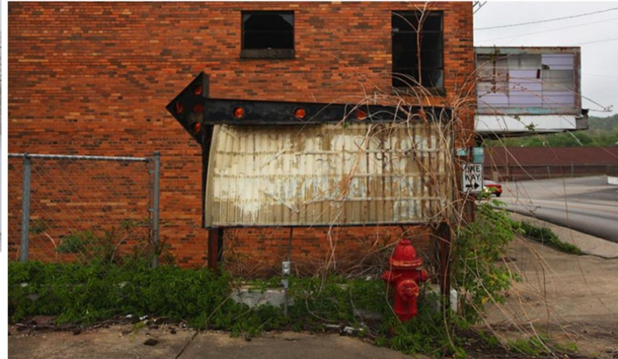
Downtown Booneville, Ky., in 2012.

A prescription for impoverished communities