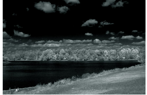
Fade to Black