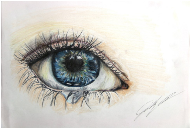
Eye of the Storm