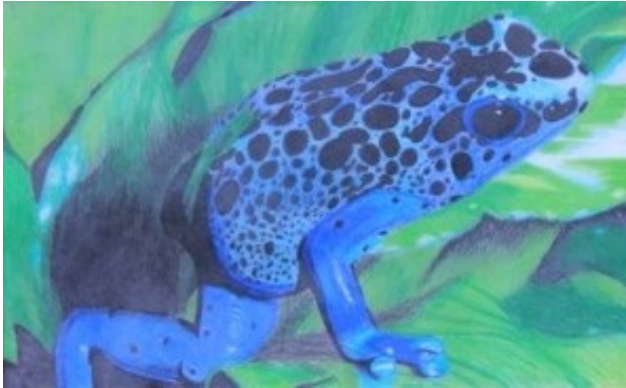
Blue Vellum Frog