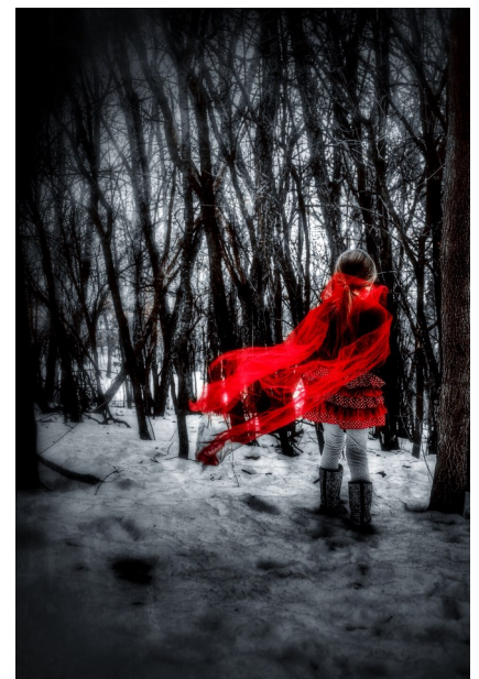
Little Red Riding Hood