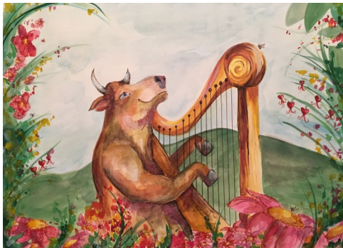
Hydrangea and Her Harp