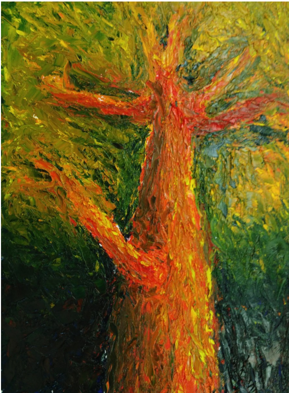
The Angry Painting