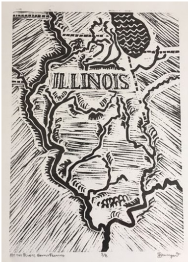
By Thy Rivers Gently Flowing