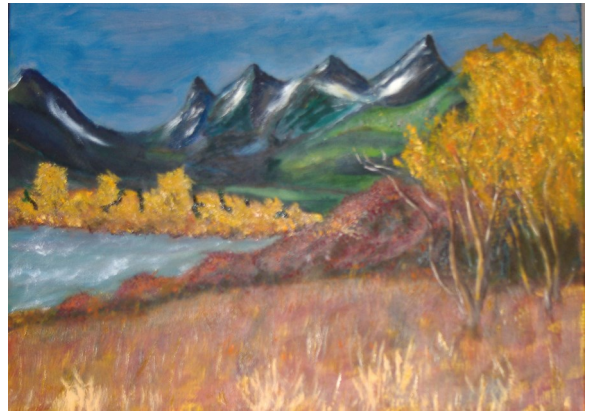
Mountain Valley Fall